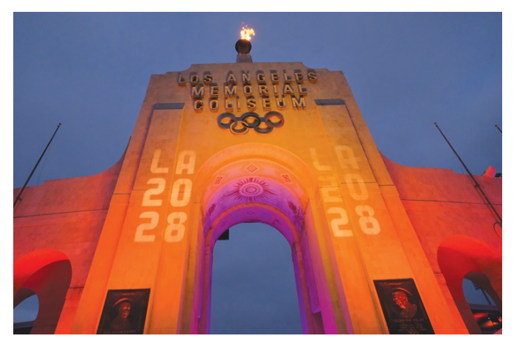
Will the lighting of the Olympic cauldron in 2028 attract the sponsorship spending needed to meet LA28's $2.5 billion goal?